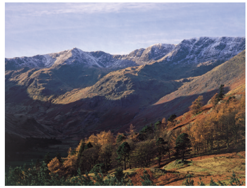
Dollywaggon Pike and Nethermost Pike.