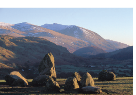
Above: Castlerigg Stone Circle and Helvellyn.